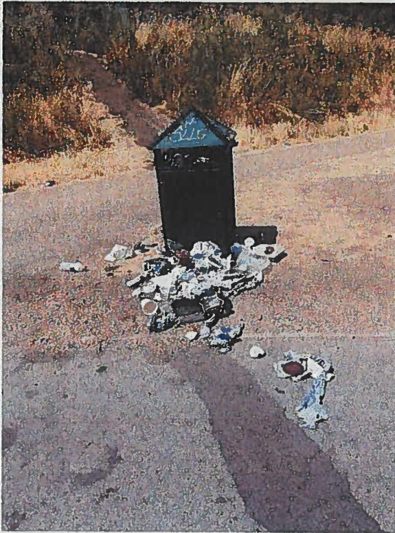
Litterbin overflowing in park near Stroud Green entrance